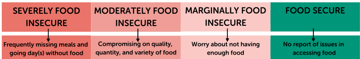
Figure 1. Food insecurity on a continuum 2 .

Food insecurity affects all aspects of daily life, as food is a basic human right and a building block for our lives, health, family connections and social interactions. Not having access to enough food can lead to significant short and long-term health impacts, including developmental delays in children, poor physical and mental health and social isolation 2 . For the prosperity of our community, people must have access to affordable, nutritious and safe food that meets their dietary needs and cultural and food preferences for an active and healthy lifestyle. See Figure 1 for the full spectrum of food insecurity.