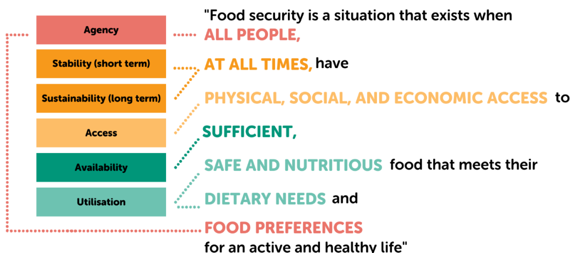
Figure 2: Identifying the six dimensions of food security 3 .

Food security is a situation that exists when all people, at all times, have physical, social, and economic access to sufficient, safe and nutritious food that meets their dietary needs and cultural and food preferences for an active and healthy life 3 . See Figure 2.